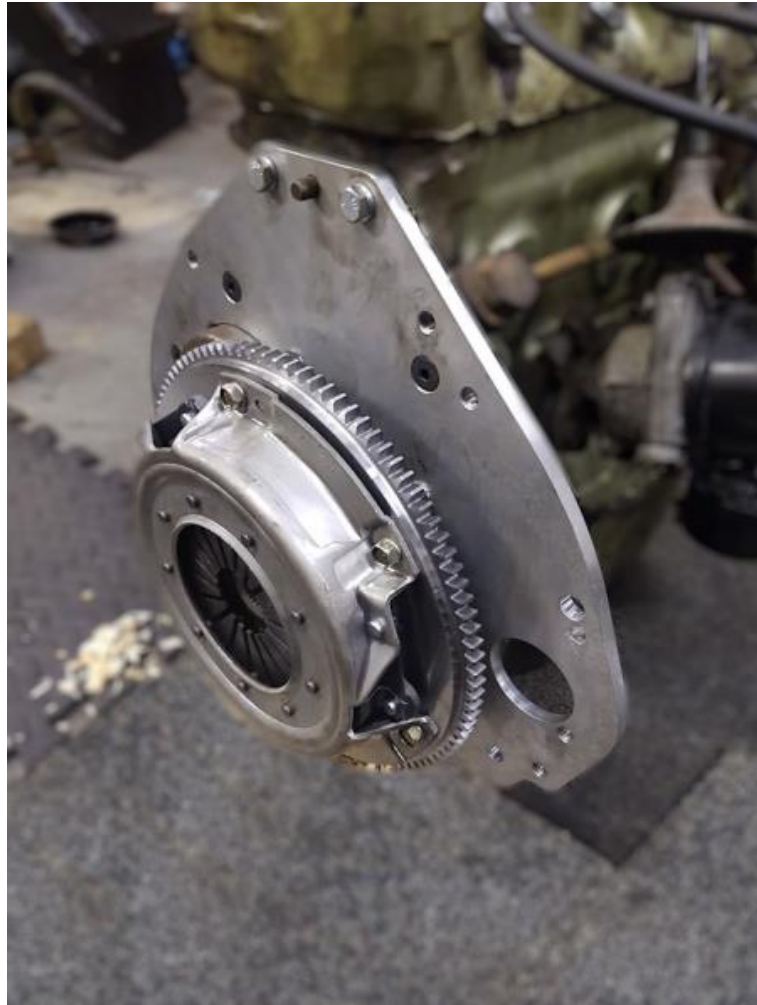
FIGURE 4: COMPLETE CLUTCH ASSEMBLY