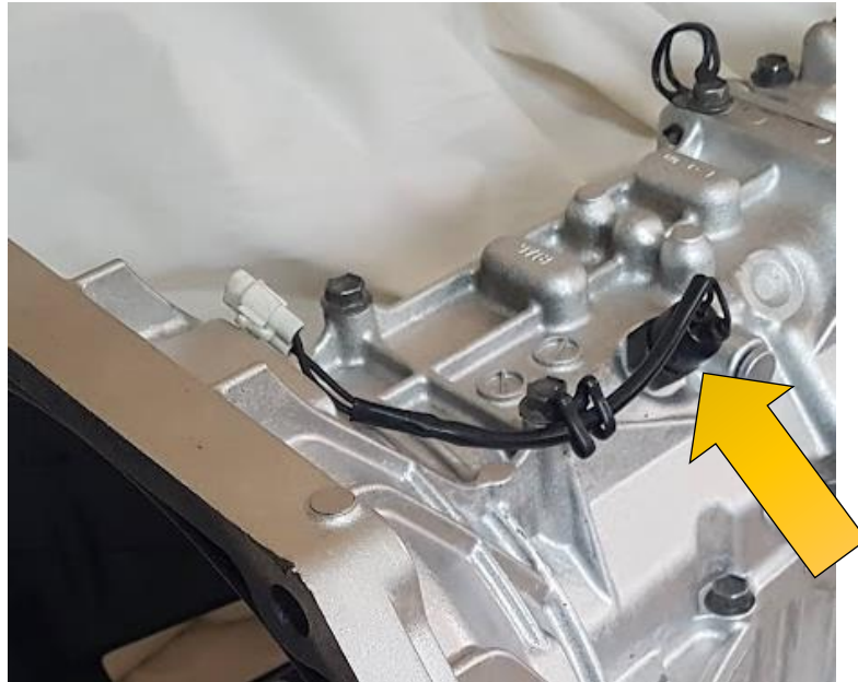
FIGURE 2: REVERSE LIGHT SWITCH