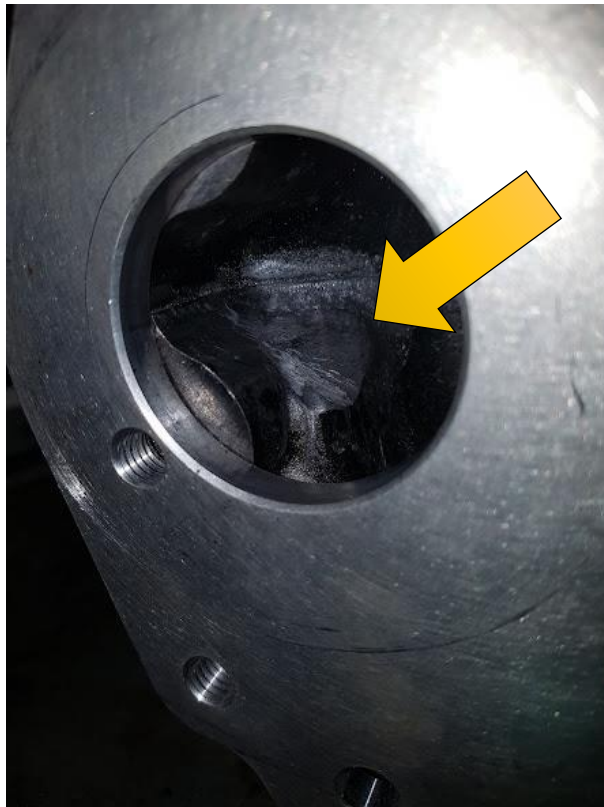
FIGURE 1: MATERIAL REMOVED FROM BELLHOUSING