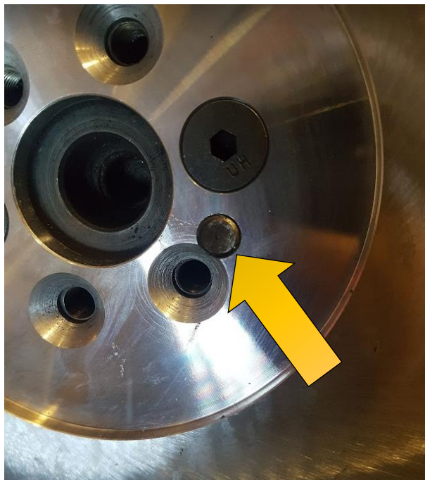
FIGURE 3: GRIND DOWEL FOR CLEARANCE